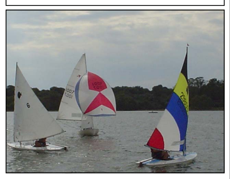
Two Sunfish split tacks headed to the windward mark while a Jet 14 threads the needle headed to the leeward mark in late season action on September 24.

<u>Analyst215@aol.com</u> (732) 310-6911